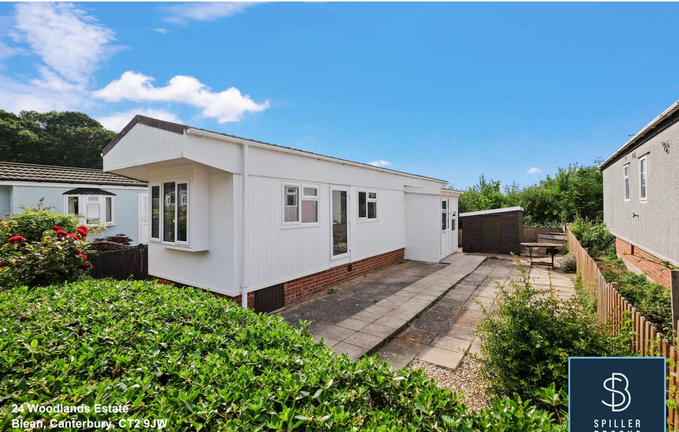
24 Woodlands Estate Blean, Canterbury, CT2 9JW